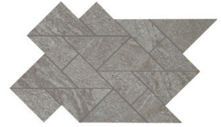
OST04.1CRSLMOS ► Mittens Crossville Mosaic<sup>†</sup>