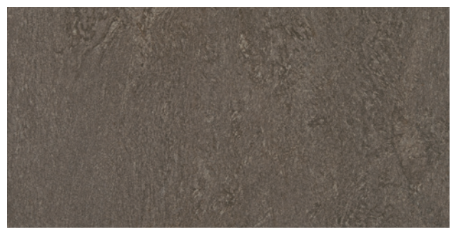
OSTO5 ▶ Sable