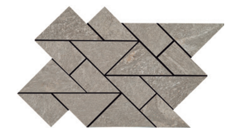
OSTO3.1CRSLMOS ► Slipper Crossville Mosaic<sup>†</sup>