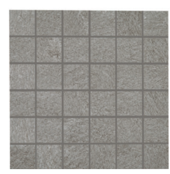
OST04.10202LMOS ► Mittens 2 x 2 Mosaic