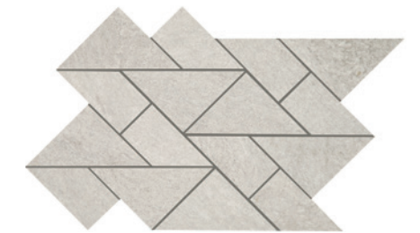
OSTO2.1CRSLMOS ▶ Bunny Crossville Mosaic<sup>†</sup>