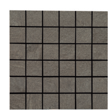
OST05.10202LMOS ► Sable 2 x 2 Mosaic