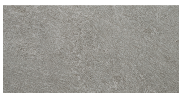
OSTO4 ▶ Mittens