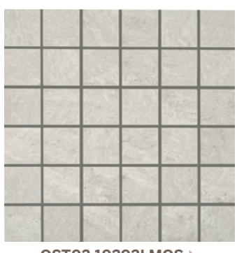
OST02.10202LMOS ► Bunny 2 x 2 Mosaic