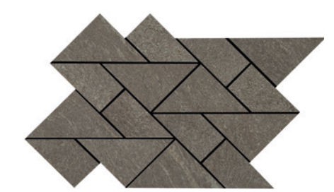
OST05.1CRSLMOS ► Sable Crossville Mosaic<sup>†</sup>