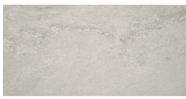
OST02 ▶ Bunny