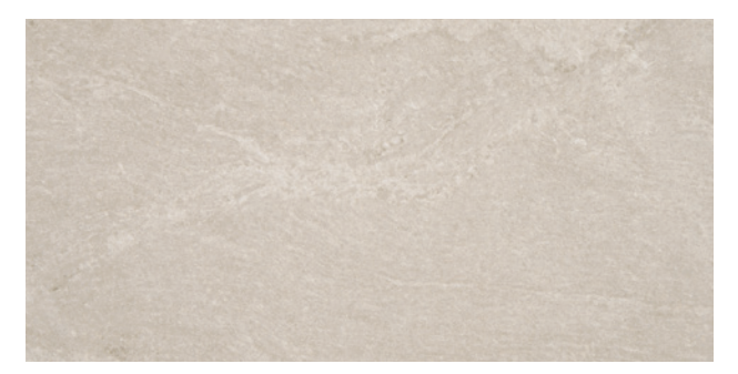
OSTO1 ▶ Down