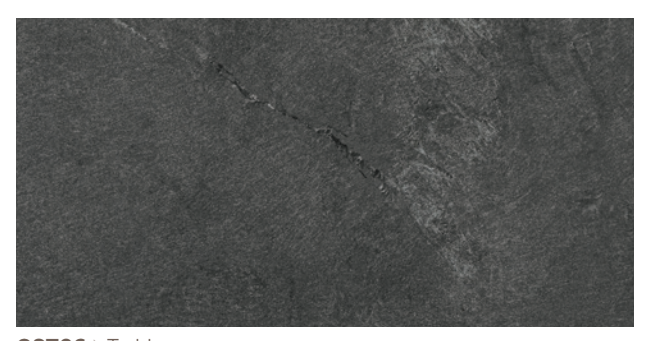
OST06 ▶ Teddy