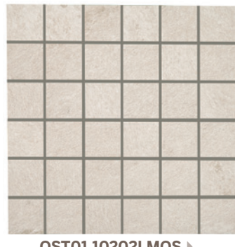
OST01.10202LMOS ► Down 2 x 2 Mosaic