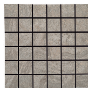
OST03.10202LMOS ► Slipper 2 x 2 Mosaic