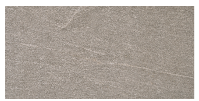
OSTO3 ▶ Slipper