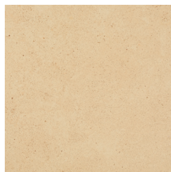
A1402 ▶ Sacred Sand I