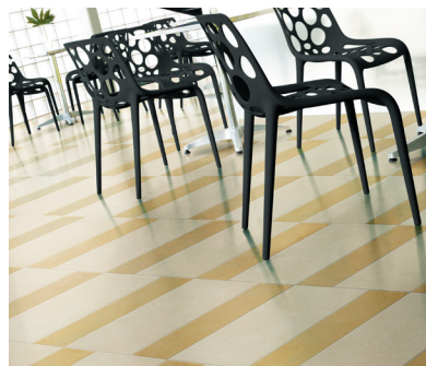
Photo Below: A1409 ▶ Lemon Drop 6 x 24 A1402 ▶ Winter Garden 12 x 24

Regular cleaning is the best way to keep Argent tile looking good for years to come. Use clean, hot water (combined with a household cleaner for more aggressive cleaning). Rinse thoroughly and dry with a soft cloth. No waxes are needed. More Information regarding the care and maintenance of Crossville® products is available at CrossvilleInc.com.