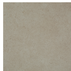
A1418 ▶ Concrete Jungle I