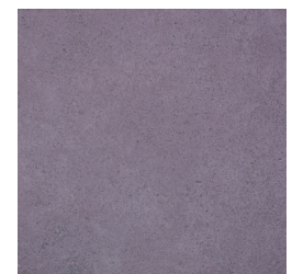
A1416 ▶ Grapes of Wrath III