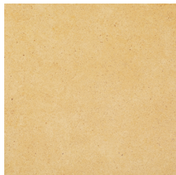
A1409 ▶ Lemon Drop II