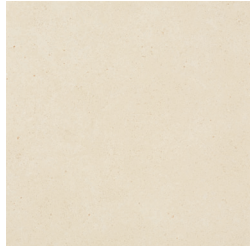
A1401 ▶ Winter Garden I