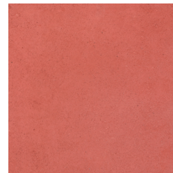
A1412 ▶ Chicago Fire III