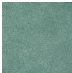
A1407 ▶ Water Vapors II