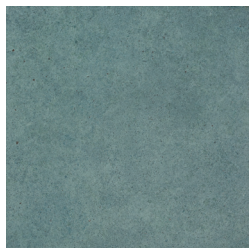
A1408 ▶ Glacier Lake II