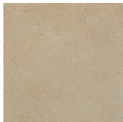
A1404 ▶ Cowboy Up I