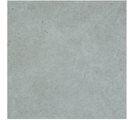
A1417 ▶ Clean Slate II