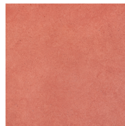
A1411 ▶ Sunset Boulevard III