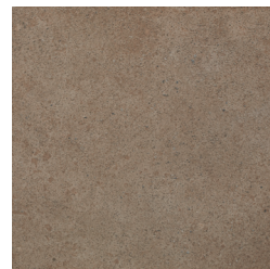
A1419 ▶ Muddy Waters I