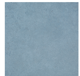
A1414 ▶ Carnegie Cool III