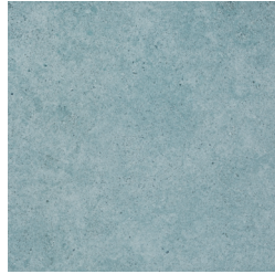
A1413 ▶ Under the Sea I