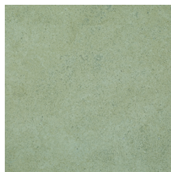
A1405 ▶ Hollywood and Vine II