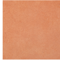
A1410 ▶ Orange Crush III