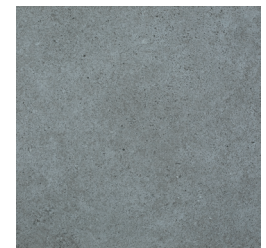
A1420 ▶ On the Rocks II

I = Price Group I, II = Price Group II, III = Price Group III