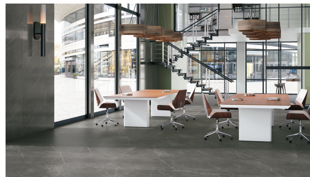
Crossville's versatile, innovative Porcelain Tile Panels may be installed in ways and on surfaces previously unthinkable for tile in architectural design.

Listed percentage is the minimum recycled content in each product. Actual recycled content may be greater