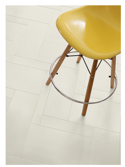
AV311 ► Buttoned Up 12 x 24 and 3 x 24 UPS finish