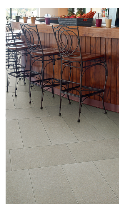
AV317 Flannel Shirt 12 x 24 UPS finish

Regular cleaning is the best way to keep Ready to Wear tile looking good for years to come. Use clean, hot water (combined with a household cleaner for more aggressive cleaning). Rinse thoroughly and dry with a soft cloth. No waxes are needed. More information regarding the care and maintenance of Crossville® products is available at CrossvilleInc.com.