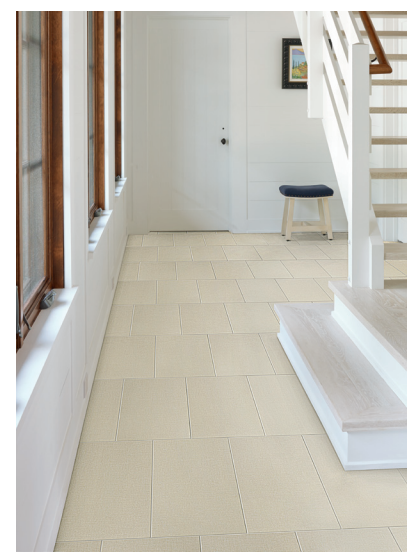
AV313 ► Off the Cuff 12 x 24 UPS finish