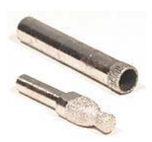
Top - Core Drill Bit Bottom - Blunt Nose Bit

Diamond drill bits come in many different sizes and shapes but are primarily of two basic styles, blunt nose bits and core drill bits . There are also two basic types of diamond drill bits relating to the application of the diamonds; bonded and sintered .