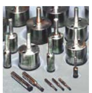
Core Drill Bits

Since Blunt Nose bits drill out the complete hole, they are only effective for smaller holes. This style of bits are only available in