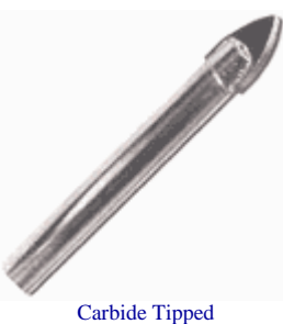
Carbide Tipped Spear Point Drill Bit