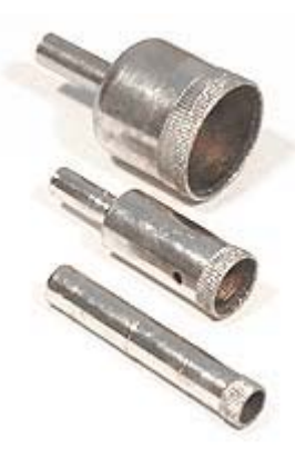
Core Drill Bits

Diamond drill speeds vary depending upon the manufacturer and type of diamond drill. Glastar Blunt Nose Diamond Drills are designed to be used at high speeds up to 10,000. HK Diamond Core Drill Bits should be used at slow to very slow speeds, with the speed decreasing as the hardness and abrasiveness of the material increases. Also, since the circumference of a bit increases as the bit diameter becomes larger, the drill rpm speed must be reduced on larger bits to offset the increased speed at which the outside cutting edge is moving.