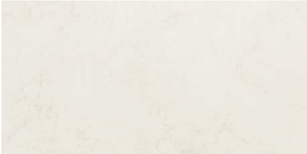
AV321 ▶ Lamp Post