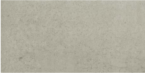
AV323 ▶ Clock Tower