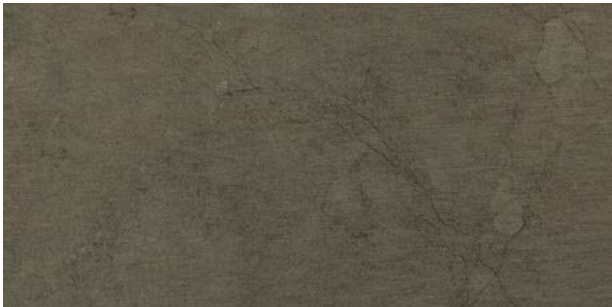
AV325 ▶ Dockside