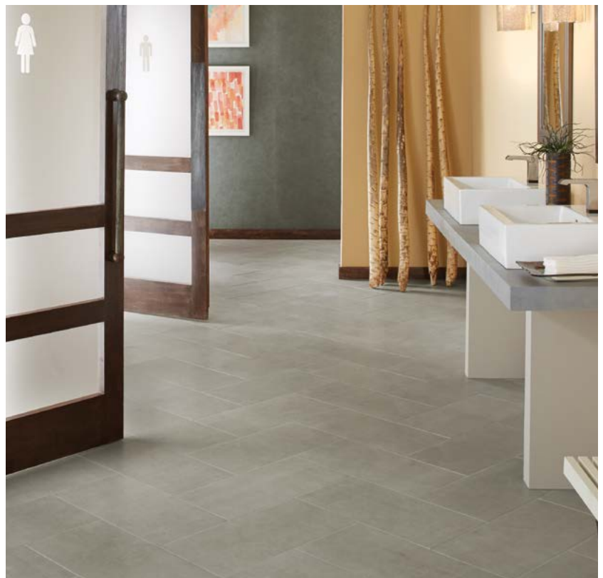
AV323 ▶ Clock Tower 12 x 24