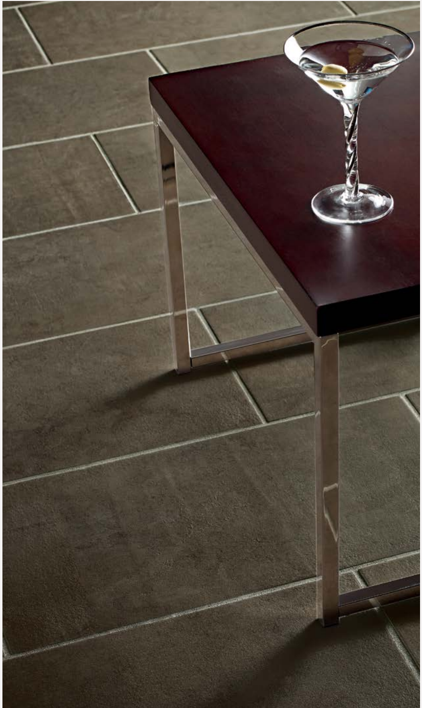
AV325 ▶ Dockside 12 x 24

Each tile color in the Gotham series takes inspiration and its name from iconic cityscapes. Take a bold step out of the shadows just as the sun rises on Gotham. From sidewalk to skyscraper, Gotham has you covered with Crossville's latest porcelain tile.