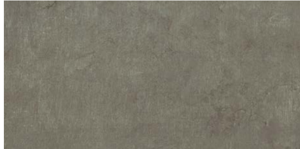
AV324 ▶ Mainline