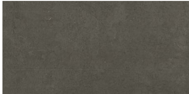
AV326 ▶ Pavement