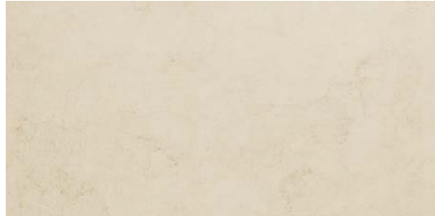
AV322 ▶ Penthouse