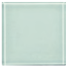
IG20 Clear Sparkle