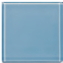
IG21 Blue Topaz